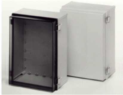
This is a sample photo.