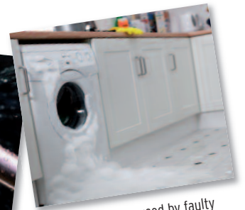
Follow-up costs caused by faulty appliances