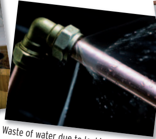
Waste of water due to leaking pipes