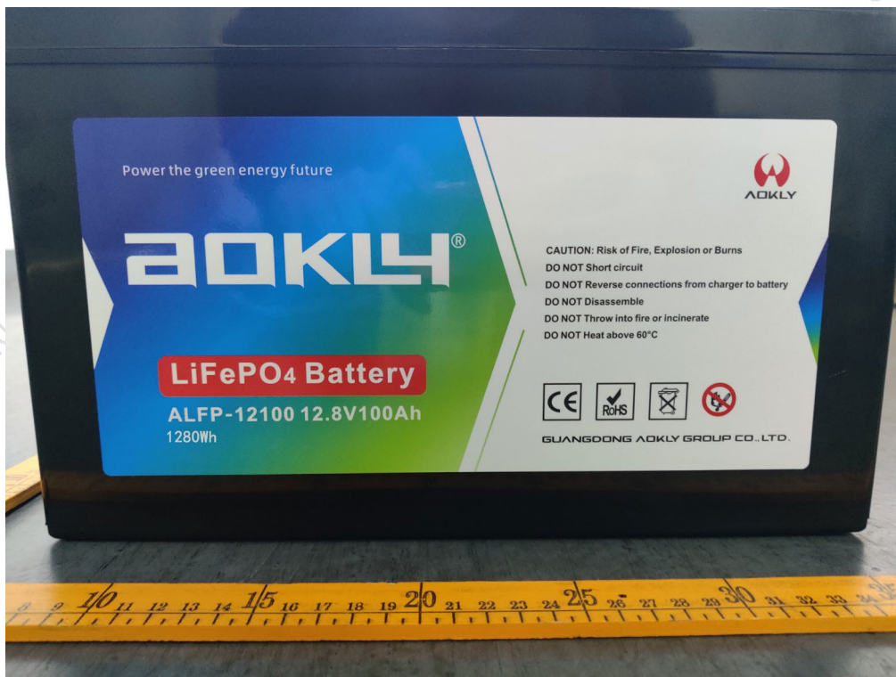
Figure 4 Battery Label (标签图)