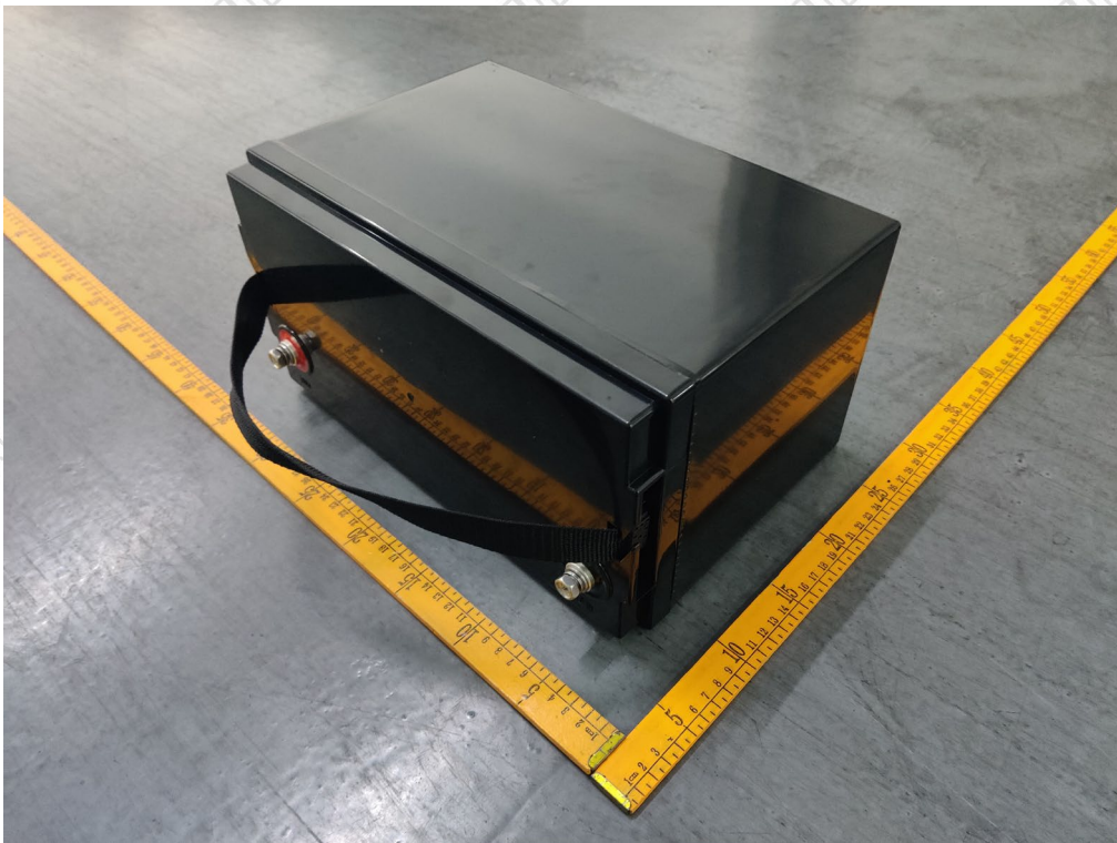
Figure 2 Overall view II of battery (外观图II)