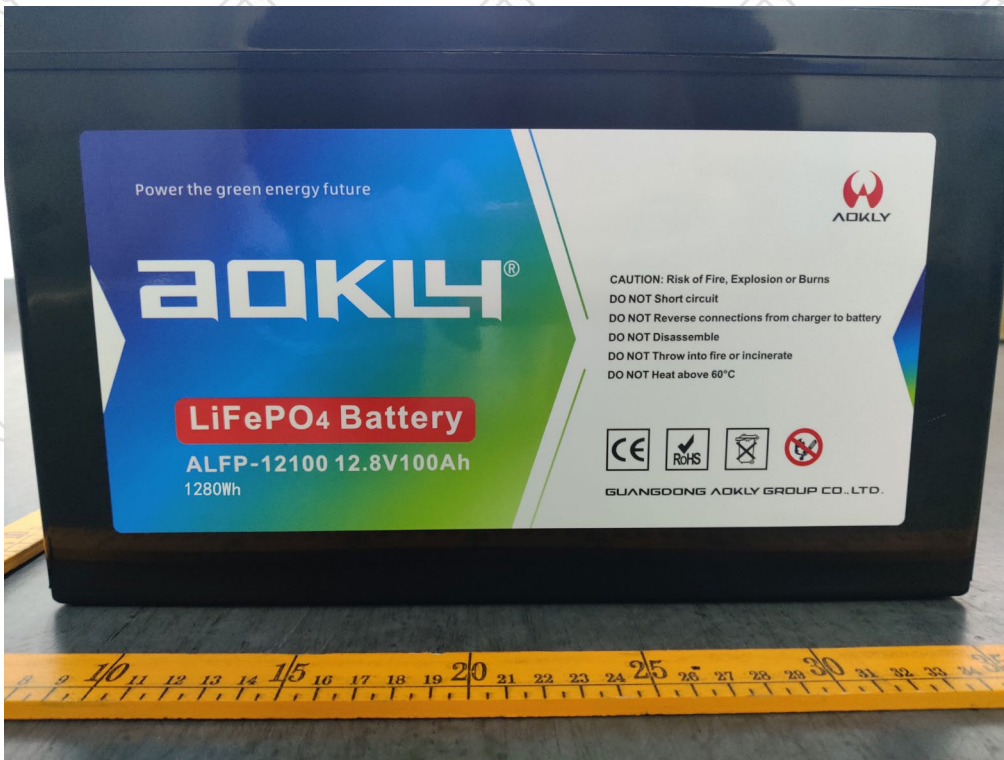
Figure 4 Battery Label (标签图)