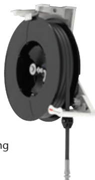
Reel with arms in ceiling mounting position.