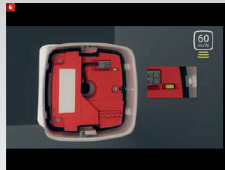
Choose between high efficiency and high output settings.