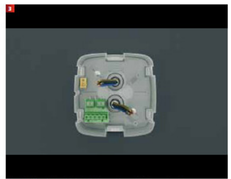
Bring cables through glands, strip back and screw base moulding to mounting box.