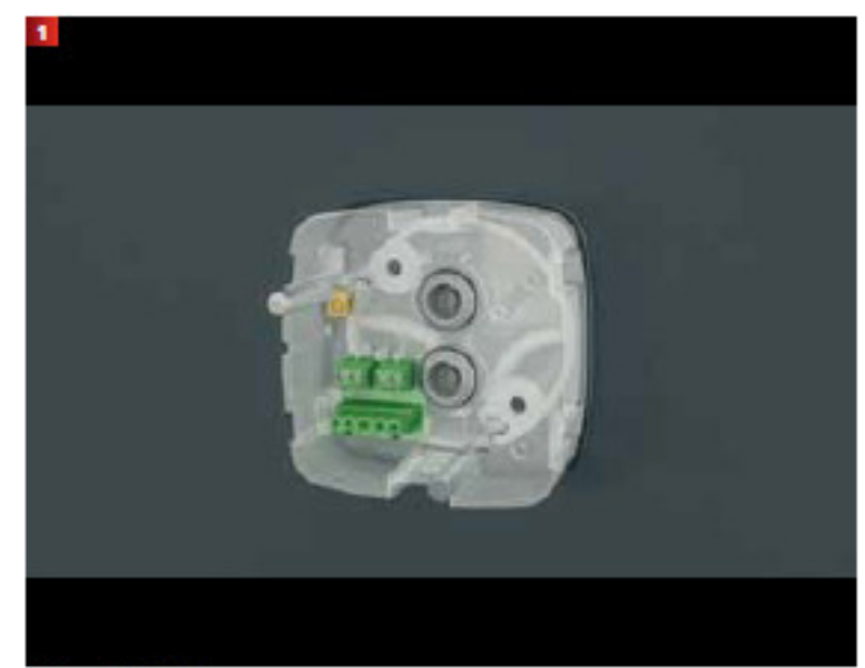
Mark-out and drill holes.