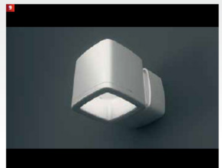
Snap bezel onto the fitting.