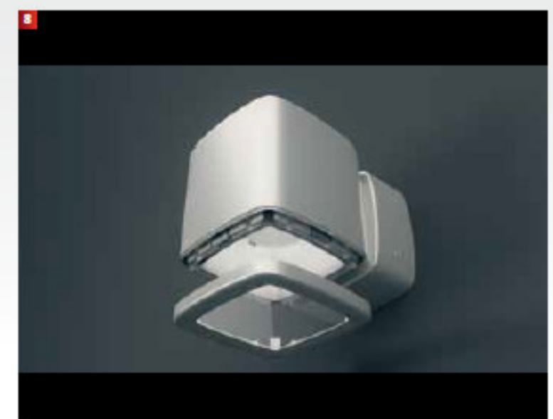
Add any accessories.