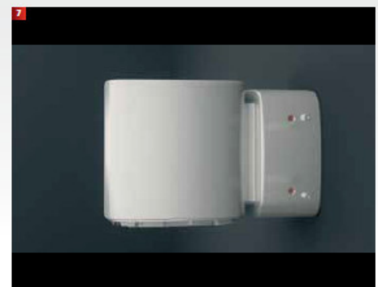
Fit head to base and tighten screws to seal.