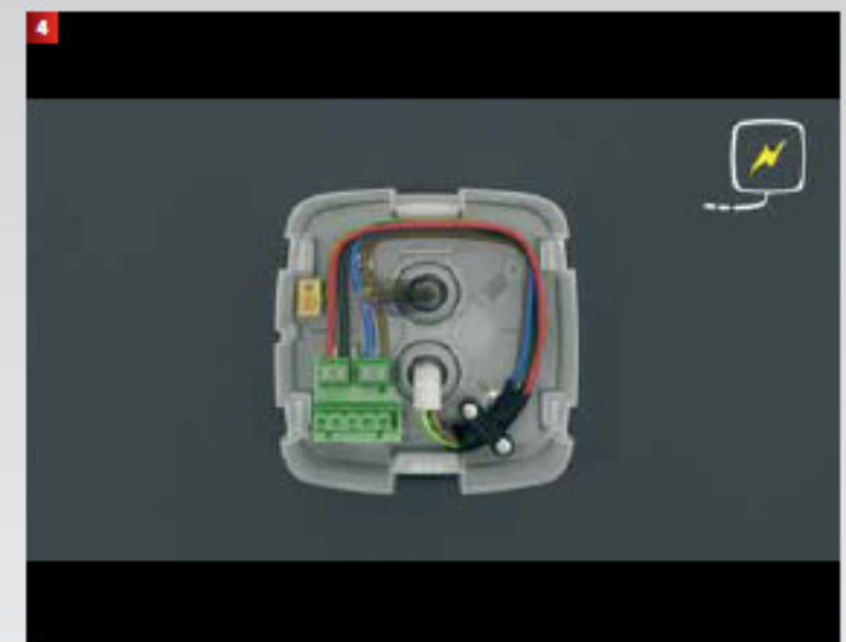
Add Vidalfox sleeving, clamp power-in cable and wire-in to terminal blocks.