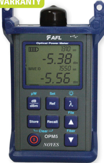
OPM5 Optical Power Meter