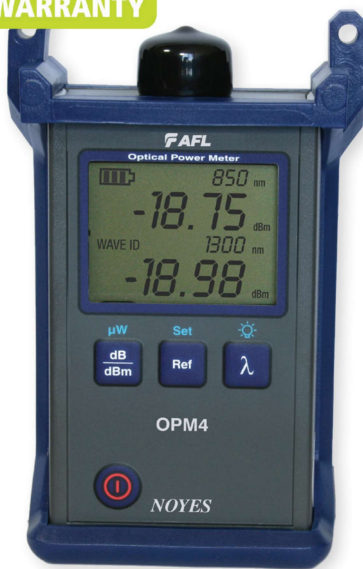
OPM4 Optical Power Meter